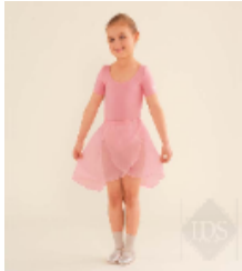
Skirt up to G1