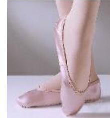
Satin Ballet Shoes