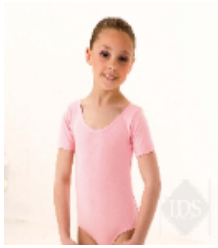
Leotard up to G1